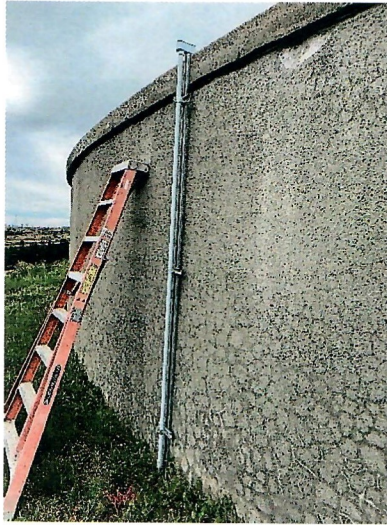
4 - Conduit Installation at Hilltop Site

As of this date, the only item that may cause a delay to the project is the availability and procurement time of the corrosion-resistant fiberglass doors. Interstate and Western are looking at alternate products such as solid wood.