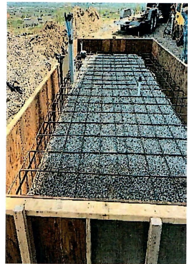
3 – Formwork and Rebar at Ox Bow

Professionals you need, people you trust