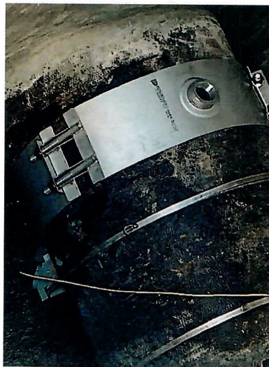
2 – Water Service Saddle at Ox Bow